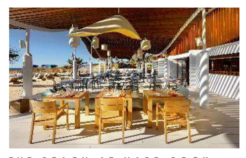
THE BEACH AT HARD ROCK Type of cousine: Mediterranean Regular set-up: 180 seated Preferred Service: Beach time!