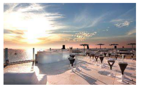
THE NINTH ROOFTOP Type of cousine: International Regular set-up: 400 standing up Preferred Service: Finger buffef