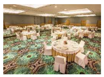
W O O D S T O C K B A L L R O O M Type of cousine: International Max. Capacity: 400 seated (banquet style) Preferred service: Formal dinners