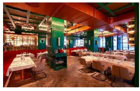
T A T E L Type of cousine:Mediterranean Regular set-up: 300 seated Preferred service: Formal dinners