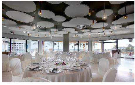
SESSIONS RESTAURANT Type of cousine: International Regular set up: 332 seated Preferred Service: Buffet style