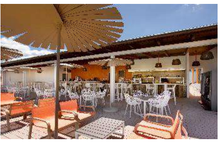
MUNCHIES Type of cousine: Snacks Regular set-up: 60 seated Preferred service: Light lunch