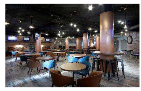
3 R D H A L F Type of cousine: American bar Regular set-up: 240 seated (imperial style) Preferred Service: Open bar till late