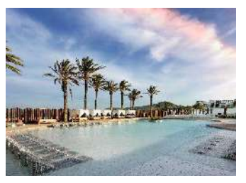
E D E N B A R Type of cousine: Snacks Max. Capacity: 350 standing up Preferred service: Welcome drink